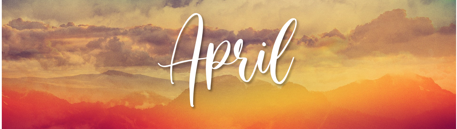
"He is not here; He has risen!" - Luke 24:6-7