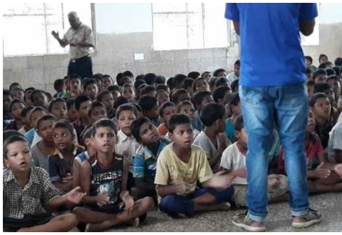
Above: The boys at Childrens Fellowship of India.

I also had the privilege of preaching at the Boys and Girls Christian Home, about 30 miles away. They have about 225 boys and girls. I was also very impressed with that facility. They are in the process of building a brand new boys dormitory, which should be finished next March. Between the two orphanages, nearly 100 boys and girls opened their hearts Jesus and were proud to acknowledge Him as their Savior. It was a true work of the Holy Spirit, in the hearts and lives of so many precious souls.