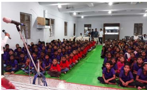
Above: The boys and girls at the Boys and Girls Christian Home.

I also had the privilege of preaching at the Boys and Girls Christian Home, about 30 miles away. They have about 225 boys and girls. I was also very impressed with that facility. They are in the process of building a brand new boys dormitory, which should be finished next March. Between the two orphanages, nearly 100 boys and girls opened their hearts Jesus and were proud to acknowledge Him as their Savior. It was a true work of the Holy Spirit, in the hearts and lives of so many precious souls.