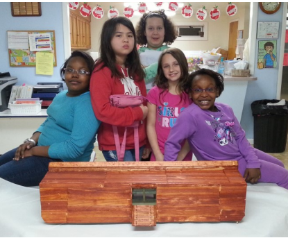
Kids' Klub in 4-D finish building Noah's Ark ( in the foreground ).

The apostle Paul encouraged us all when he exhorted us with these words, "you are all sons of God through faith in Christ Jesus, for all of you who were baptized into Christ have clothed yourselves with Christ. There is neither Jew nor Greek, slave nor free, male nor female, for you are all one in Christ Jesus" (Galatians 3:26-28). His point is that we are no longer being treated as children, but rather as adults, "sons of God." It was like the Jewish custom whereby a boy or girl becomes an adult. For the boys it is called bar mitzvah, for the girls bat mitzvah. Literally "son (or daughter) of the divine law." In a similar way, in Christ God treats us as adults. In the Old Testament believers were under the law. In the New Testament we are under grace. The law was our schoolmaster to