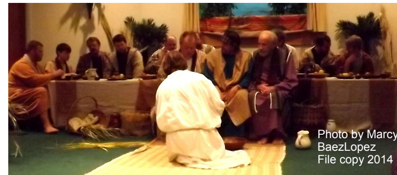
File copy 2014

SAT March 28, 6:30pm Palm SUN, March 29, 8:30 & 10:30am